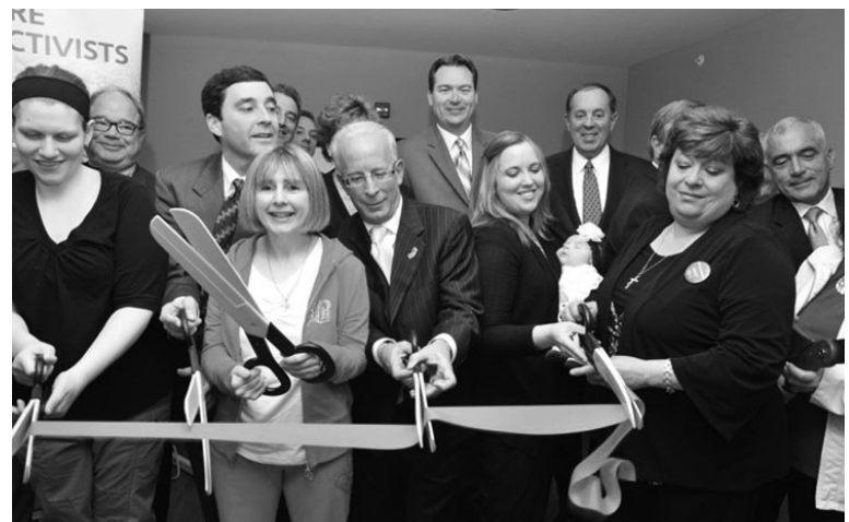
Residents and officials cut the ribbon to celebrate the Kershaw Commons grand opening!

programming and support services provided by the National Multiple Sclerosis Society. Residents have access to a variety of recreational and social programs such as tai chi and yoga, ongoing educational lectures, self help groups, and easy access to